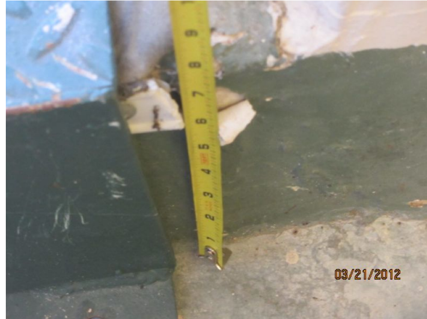
Reinforced Concrete Roof Deck