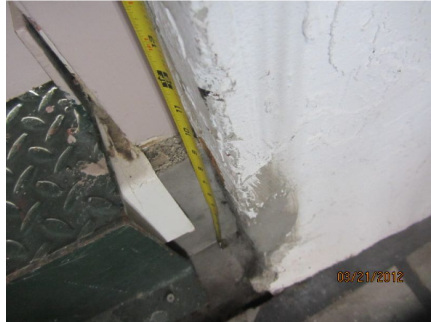
Reinforced Concrete Roof Deck